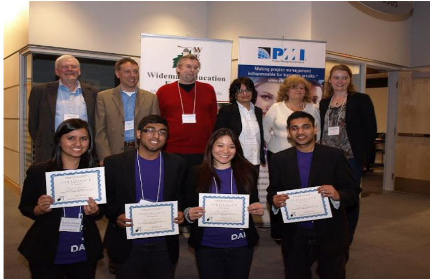
2012 Wideman Competition Winning Team: 2012 “Don’t Hate, Just Dance” – and Judges