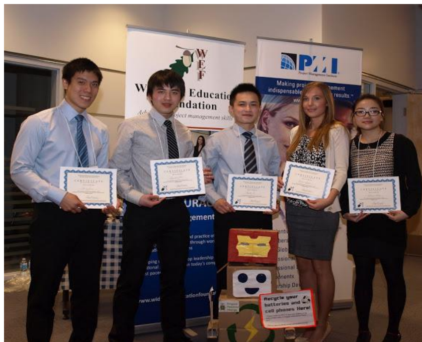
Competition 1 st Runner Up – “Team Positive Charge”