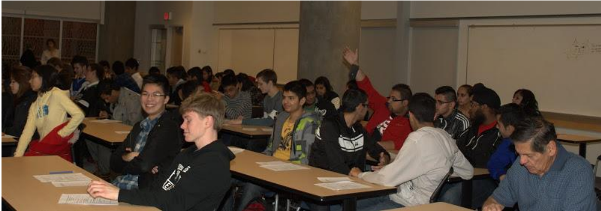
“Step up to Opportunity” – a full house!