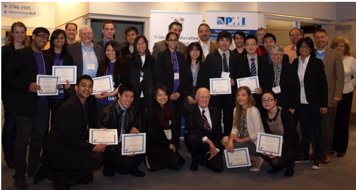
2012 Wideman Competition Prize Participants