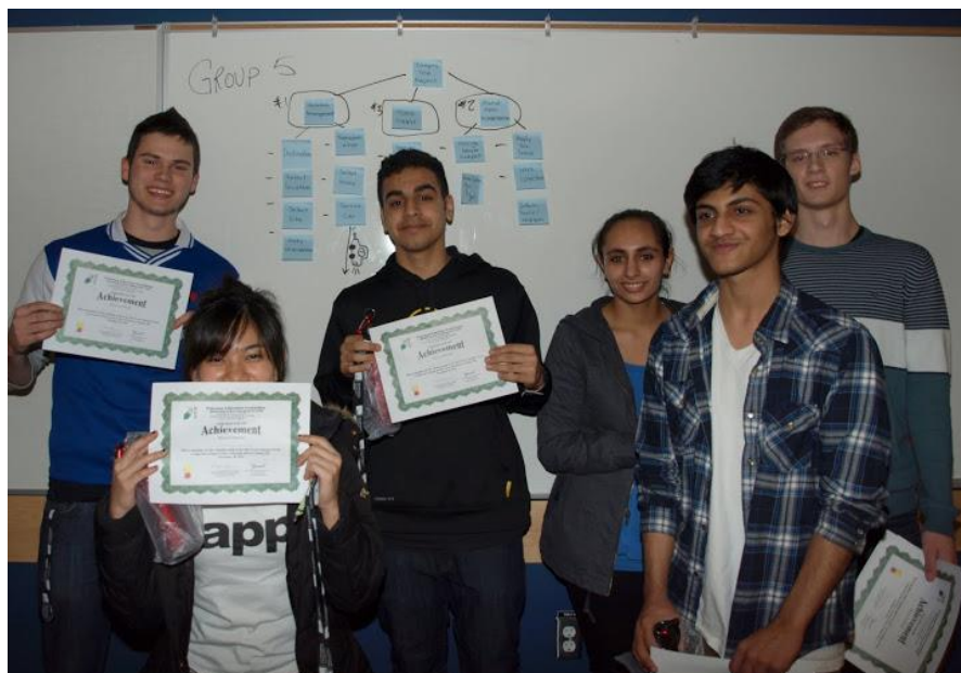
Winning team – well done!