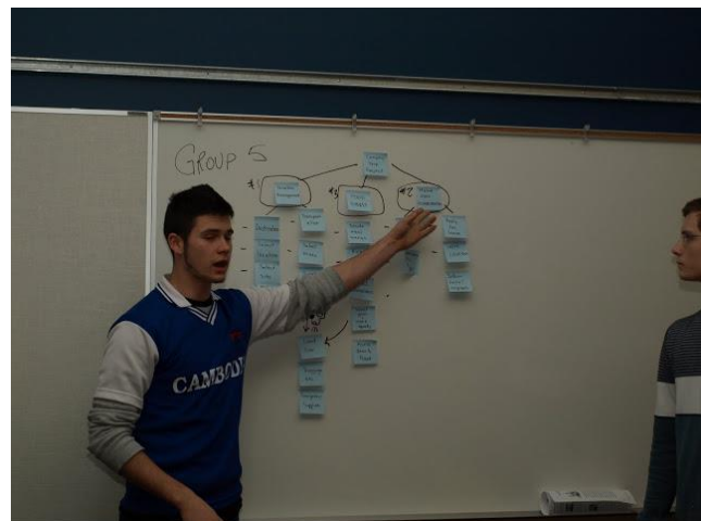
Presenting the work