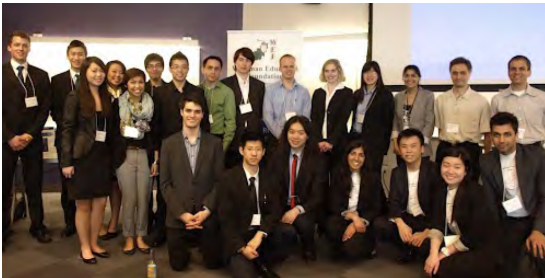
WEF 2011 Competition Finalists