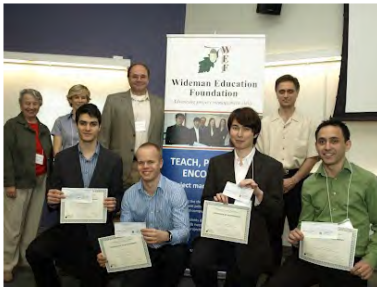
WEF 2011 “WEF Wideman Prize for Project Management Excellence” Competition Winners